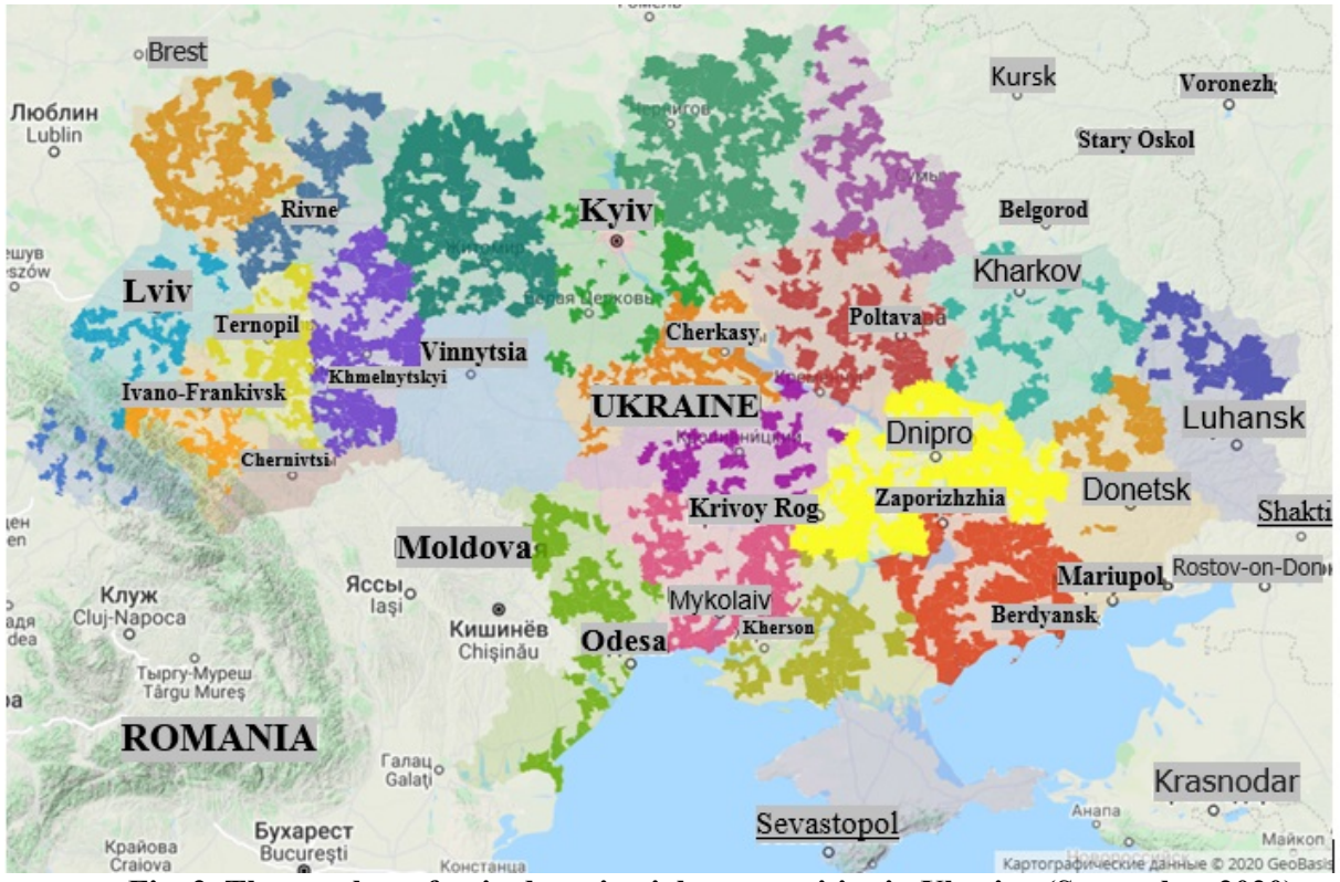
Fig. 2. The number of united territorial communities in Ukraine (September 2020)

problems, first of all, lies in the representatives of local authorities, whose activities ensure the viability of the territory. According to official data, as of September 2020, 1469 communities have been created (Fig. 2).